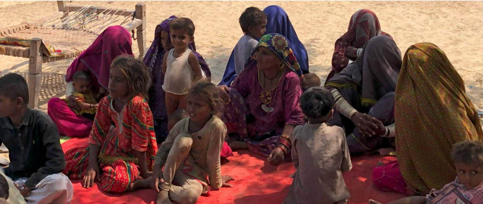
Photos from the 1st, 2nd, and 3rd villages that were visited during the outreach.

spent 3 hours in that village. That was a very blessed time.