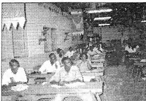
Some of the pastors and wives studying at the night classes of the Bible Institute in Tema, Ghana. These servants work other jobs during the day and study at night. Most make less than $20.00 monthly from their church salaries